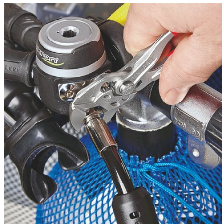
the mini pliers wrench for precision mechanics